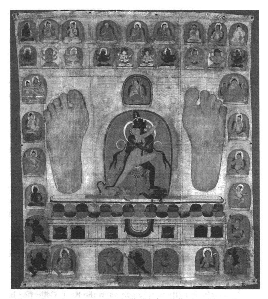
Fig. 5 Footprint on embroidered silk, Pritzker Collection; Photo: Hughes DuBois.

an unusual lineage, with an enigmatic siddha represented to the right side that unlikely is part of the lineage. ①