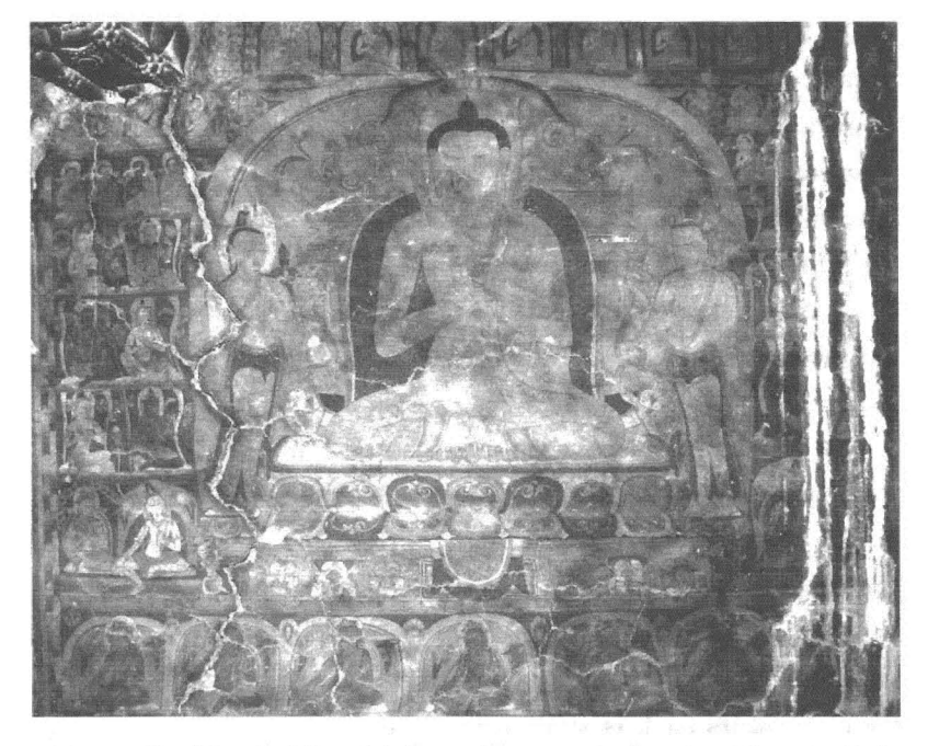
Fig. 8 Teaching Buddha with Seven Tārās at the bottom, Three-storied Temple, Wanla. Photo: C. Luczanits 2003 16,19

Triple Jewel depicted on the throne alone.