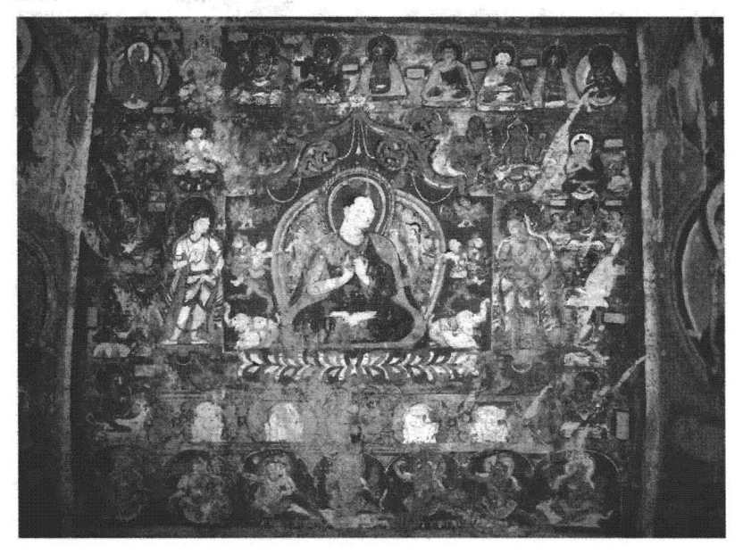
Fig. 2 Drigungpa in the Small Chörten in Alchi, Ladakh.

of the teacher developed alongside reflects the public elevation of the teacher from a pious practitioner to an enlightened being. Consequently the representation of the teacher orients itself on the Buddha image. In addition, all the paintings under discussion share the group of eight (or nine) mahāsiddha, who are depicted at the sides of the painting in a form that is peculiar to the Drigungpa school. This point will be discussed in greater detail below.