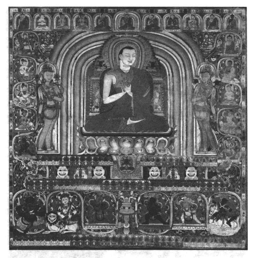
Fig. 3 Hierarch following Drigungpa. Pritzker Collection