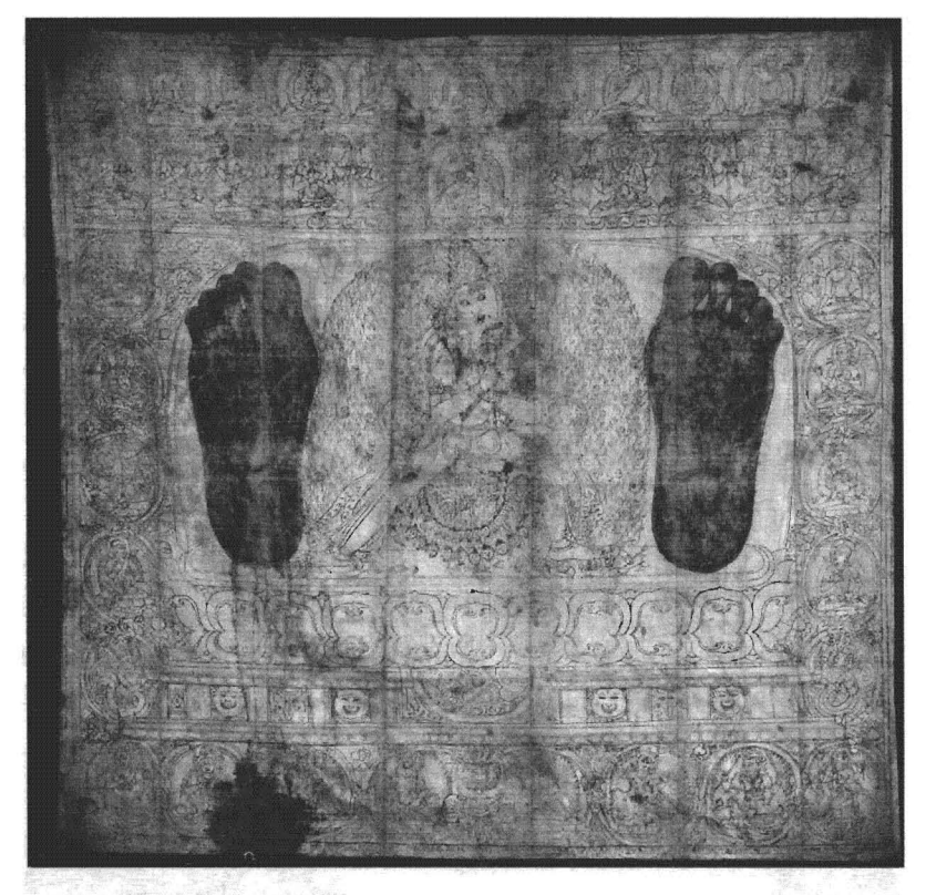
Drigungpa's footprints and drawing on silk. Rubin Museum of Art, New York.

the top center. Immediately below him follows Drigungpa, who founded the Drigungpa school and was a prominent pupil of Phagmodrupa. He and his school are named after the place where he founded a monastery in 1179. Drigungpa follows Phagmodrupa in appearance, both are shown frontally and performing the teaching gesture, and both are identified by captions. Drigungpa is flanked by the ten main deities of a variant or even early version of the Guhyasamāja-Aksobhyavajra / gSang-'dus Mibskyod-rdo-rje mandala, with the female forms represented on the more prominent left side and their respective partners in a